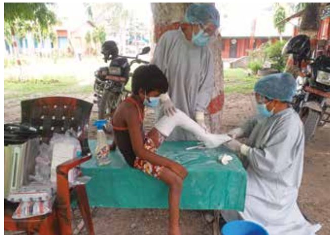
Making miracles happen, on the road.