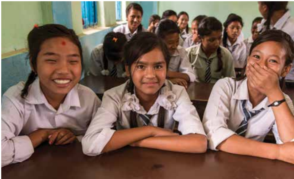
Yes to school! Three of over 32,000 girls who are happily part of SGT.

This year, there are 11,950 girls, 1,200 newly enrolled, in 492 schools across Nepal with STOP Girl Trafficking. All of them were once in danger of being sold, sent away to work, or married off too young. Instead, they are safe in school with a deep network of teachers, mentors, and SGT alums standing by them, lifting them up.